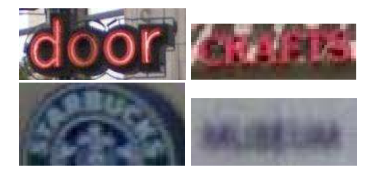
Figure 4: Street view images with different degradations (a) Improper bounding box (b) Low resolution (c) Curved text and (d) Motion blur

word images is important to recognize characters/words. Even though topdown analysis is useful in improving the recognition rate on specific datasets using a limited lexicon, it is not practical in real world situation. Weinmann et. al showed that the recognized word rate reduces with full lexicon.