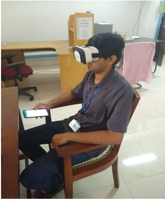
Figure 3: Participant undergoing the experiment

response capture app – Timestamp in stimulus presentation app). For each of the thirty flashes, this is calculated and using these values, the mean reaction time of a participant is calculated. Since the stimuli presented are the 3 basic colors (red, green and blue), participants rarely missed or miss-clicked. The maximum number of flashes missed by a participant is at most one; So, the accuracy is not a useful metric in the experiment and hence is not considered.